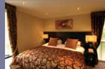
Best Western ALICIA HOTEL

Cater House, 113 Mount Pleasant, Liverpool L3 5TF Tel: 0151 709 2020 Fax: 0151 708 8212 info@feathers.uk.com