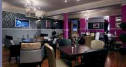
Best Western WESTMINSTER HOTEL

City Road, Chester CH1 3AH Tel: 01244 305000 Fax: 01244 318483 queenhotel@bestwestern.co.uk