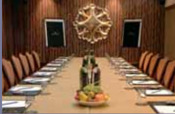
Best Western Premier QUEEN HOTEL

City Road, Chester CH1 3AH Tel: 01244 305000 Fax: 01244 318483 queenhotel@bestwestern.co.uk