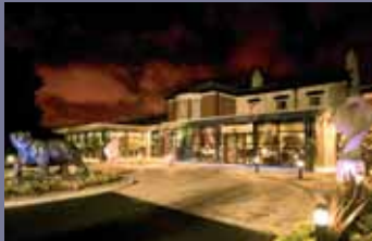
Best Western FIR GROVE HOTEL

340 Wilmslow Road, Fallowfield, Manchester M14 6AF Tel: 0161 224 0461 Fax: 0161 257 2561 willowbank@bestwestern.co.uk