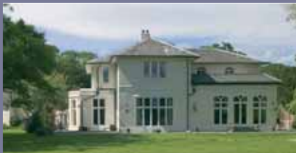
Best Western LLYNDIR HALL HOTEL