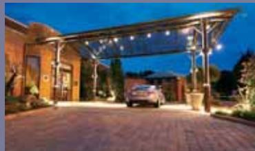
Best Western Premier LEYLAND HOTEL

Llyndir Lane, Rossett, nr Chester LL12 0AY Tel: 01244 571648 Fax: 01244 571 258 llyndirhallhotel@bestwestern.co.uk