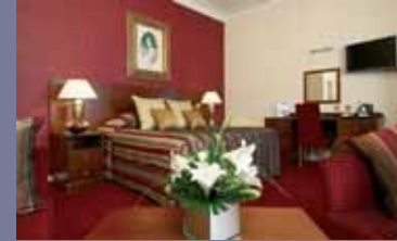
Best Western WILLOW BANK HOTEL

City Road, Chester CH1 3AF Tel: 01244 317341 Fax: 01244 325369 westminsterhotel@bestwestern.co.uk